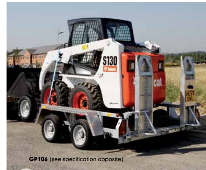
GP106 (see specification opposite)