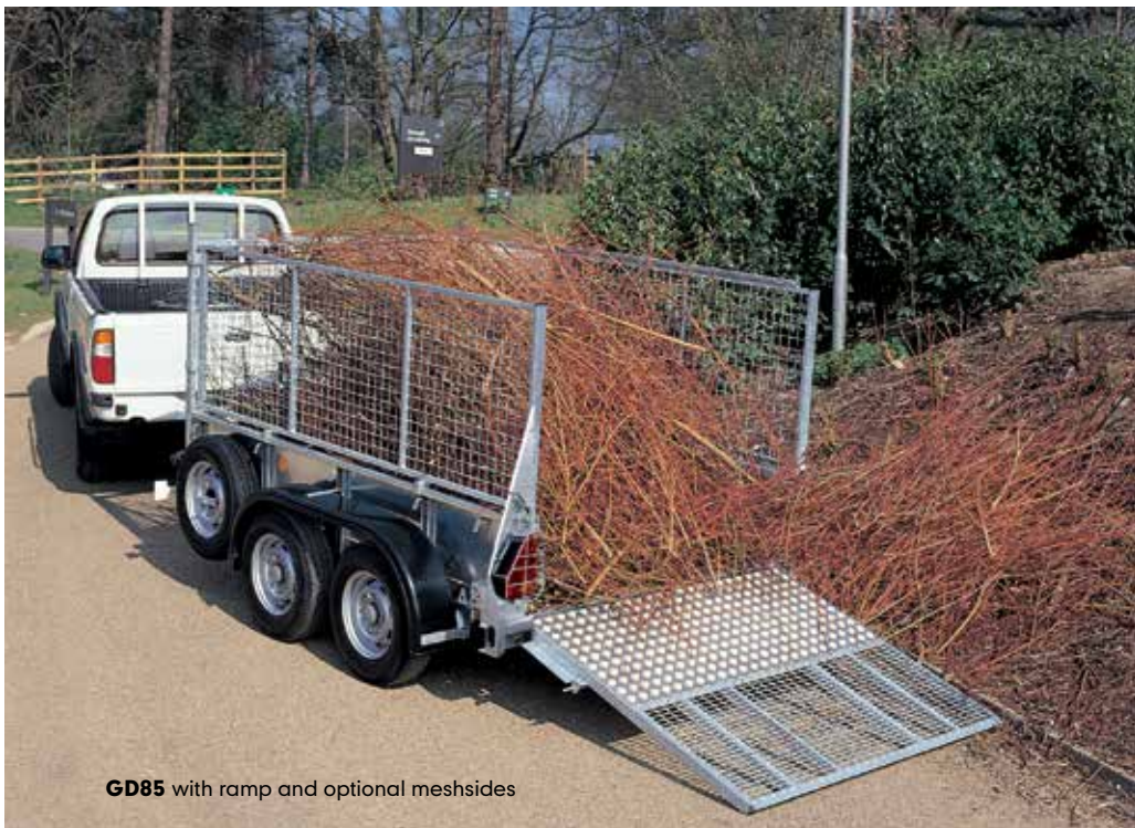
GD85 with ramp and optional meshsides