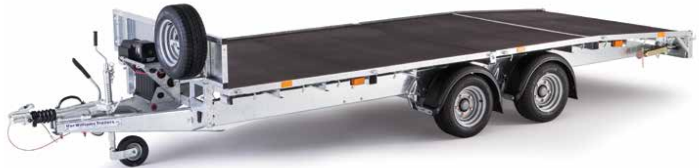
LM166/B with optional propstands

Vehicles with low ground clearance may not be suitable for loading on this type of trailer.