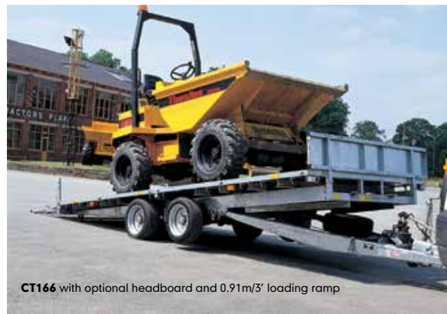
CT166 with optional headboard and 0.91m/3' loading ramp