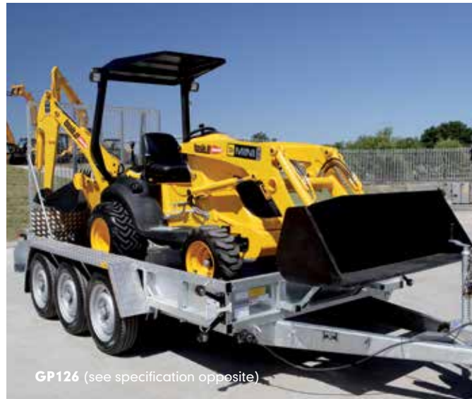
GP126 (see specification opposite)