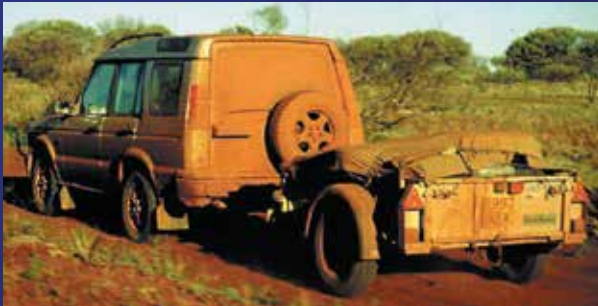
A GD64 at work in the Australian outback

Our General Duty trailers are at home in almost any environment, with virtually any type of load, from building materials to expedition equipment.