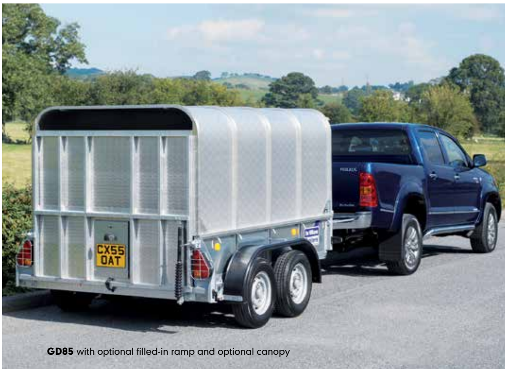
GD85 with optional filled-in ramp and optional canopy