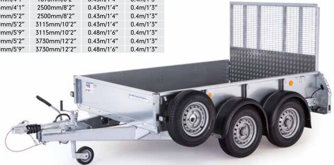
GD105 with ramp and optional meshsides