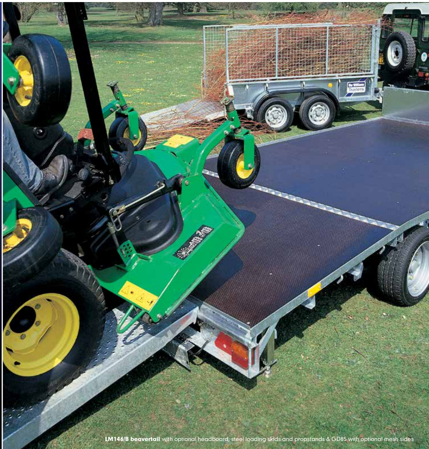
LM146/B beavertail with optional headboard, steel loading skids and propstands & GD85 with optional mesh sides

We are an independent company with one focus: to build the best products on the market. More than 30,000 people choose our trailers each year - but we're not standing still. Our dedicated investment in new technologies and materials ensures that our products continue to exceed the expectations of our customers. We know that quality, strength, value and ease of maintenance are of vital importance to you. That's why we've made them the driving force behind everything we do.