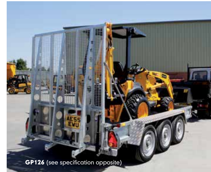
GP126 (see specification opposite)