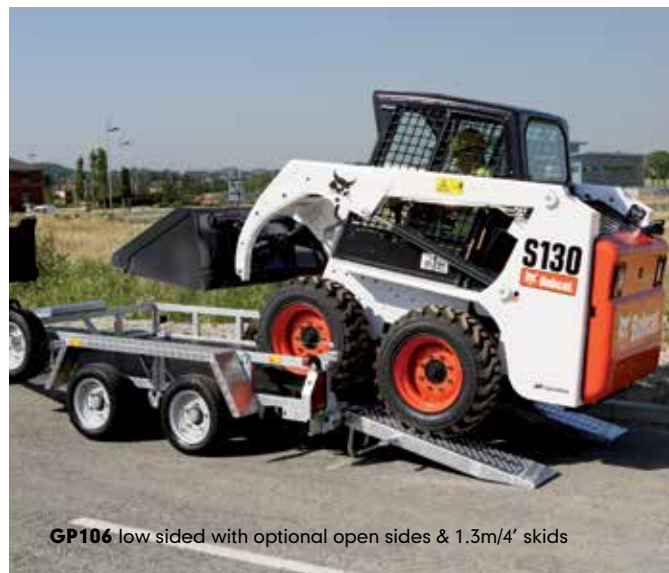
GP106 low sided with optional open sides & 1.3m/4' skids

High sided models come with filled in sides, an optional bucket rest and axles which are more centrally positioned. This option is ideally suited to users who require flexible usage from their trailer; a reliable plant trailer providing higher sides for use as a general duty trailer.