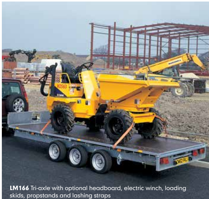
LM166 Tri-axle with optional headboard, electric winch, loading skids, propstands and lashing straps

The maximum gross weight for the LT model is 2000kg, whilst the heavier LM models offer between 2700kg and 3500kg.