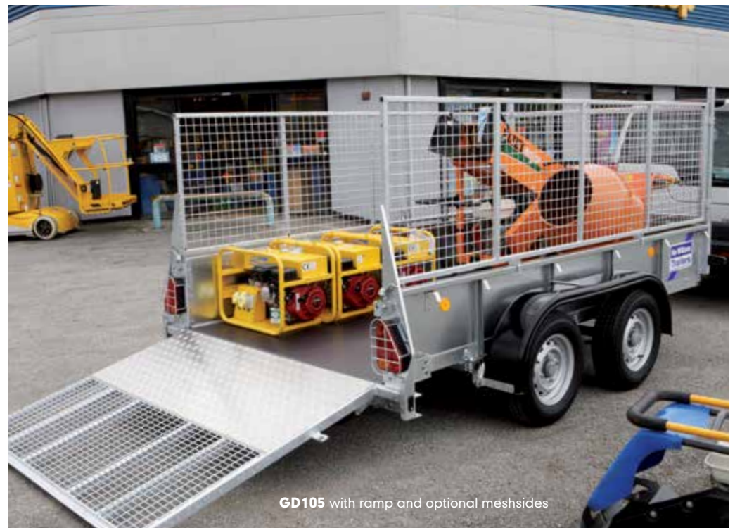
GD105 with ramp and optional meshsides