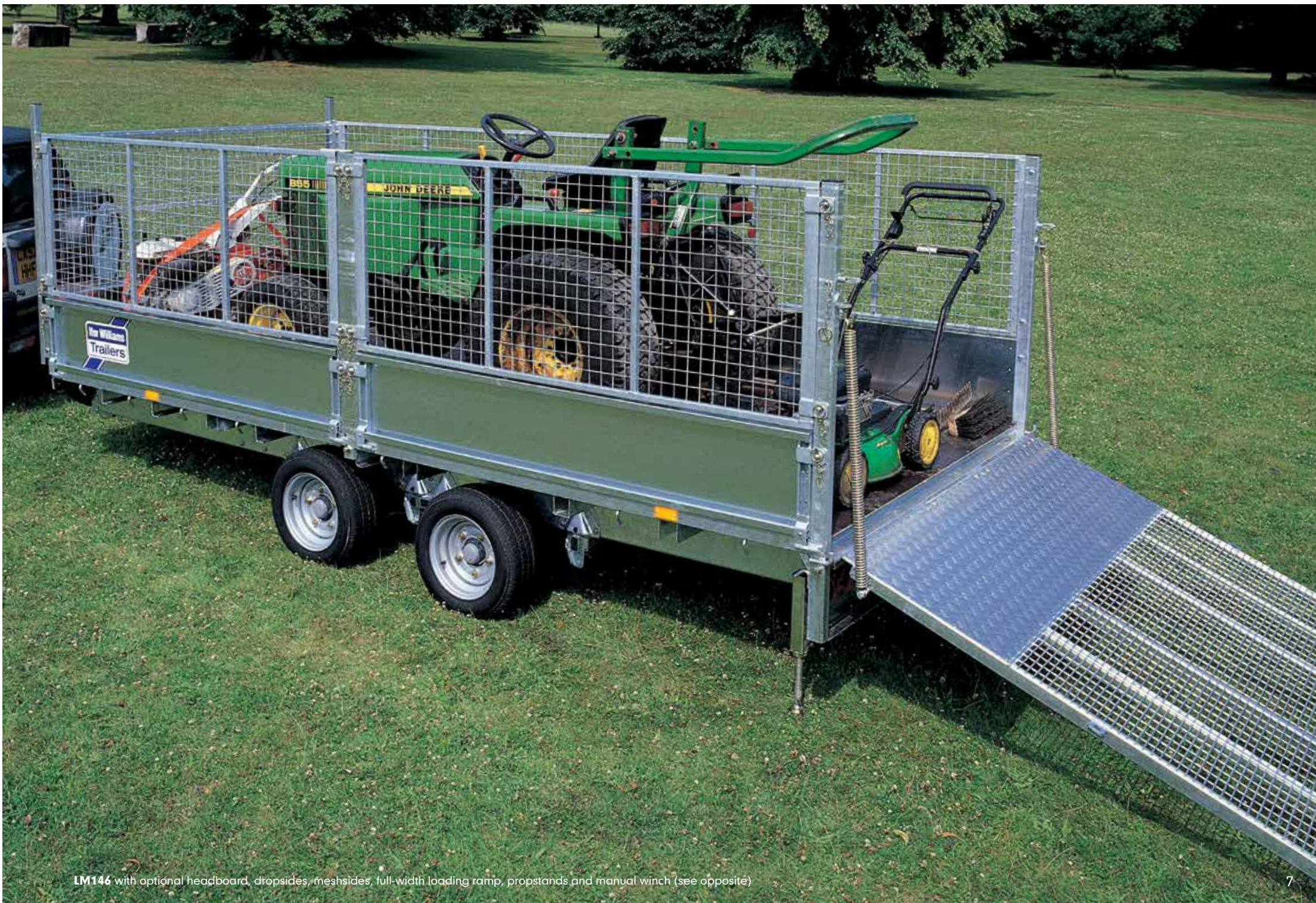
LM146 with optional headboard, dropsides, meshsides, full-width loading ramp, propstands and manual winch (see opposite)