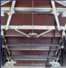
Chassis & Floor

It's the attention to detail of Ifor Williams trailers that makes our products so popular with owners. Just take a look at these standard features.