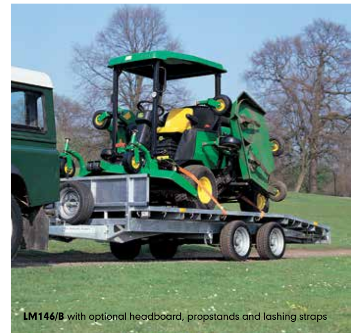
LM146/B with optional headboard, propstands and lashing straps