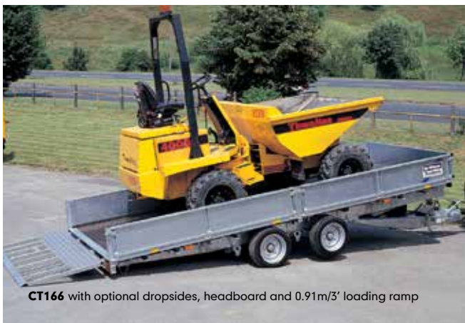
CT166 with optional dropsides, headboard and 0.91m/3' loading ramp