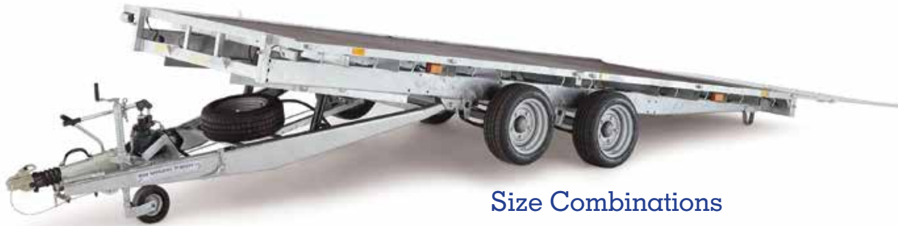
CT166 with optional 0.91m/3' loading ramp (0.3m/1' loading ramp comes as standard)