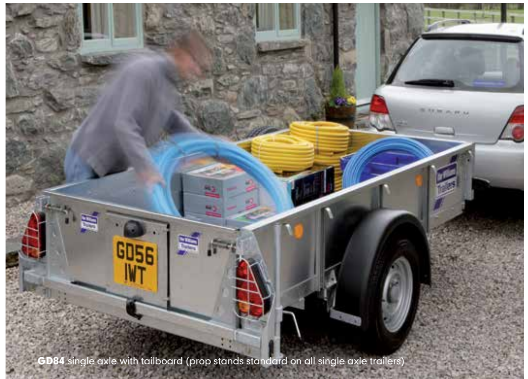
GD84 single axle with tailboard (prop stands standard on all single axle trailers)