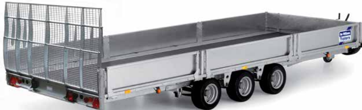
TB5521-353 with mesh rear ramp and drop sides.