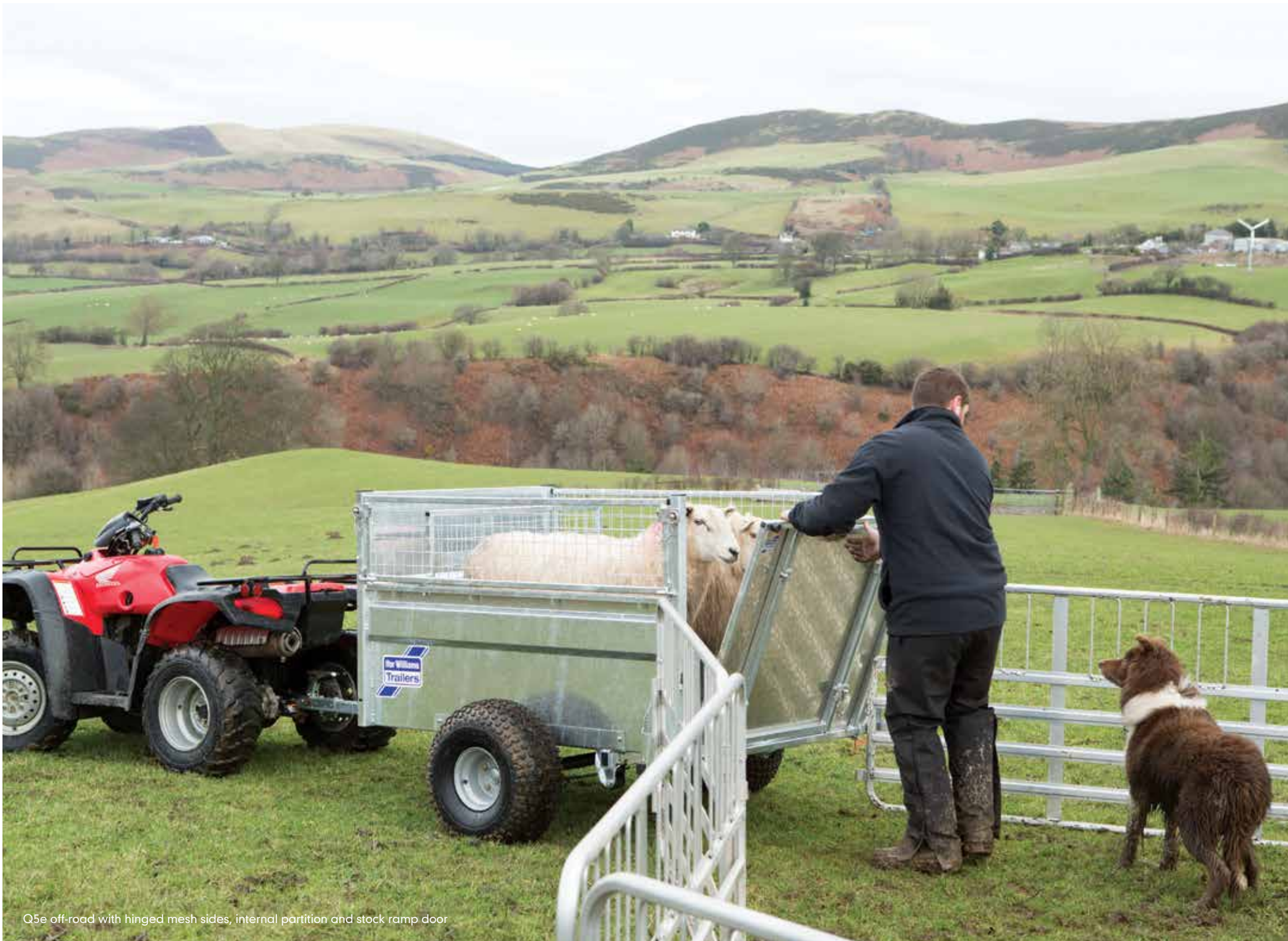
Q5e off-road with hinged mesh sides, internal partition and stock ramp door