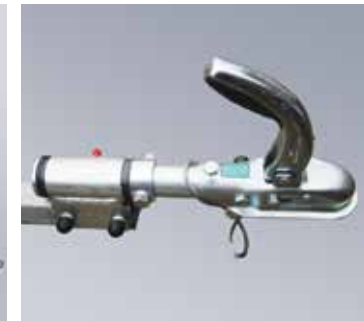
Swivel Hitch option available for off road use only (Not type approved for road use*)