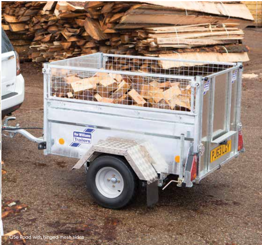
Q5e Road with hinged mesh sides

*Please check towing vehicle manufacturer's handbook for maximum unbraked towing limit.