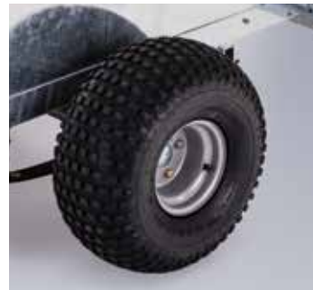
Q5e off-road knobby tyres (22 x 11-8)