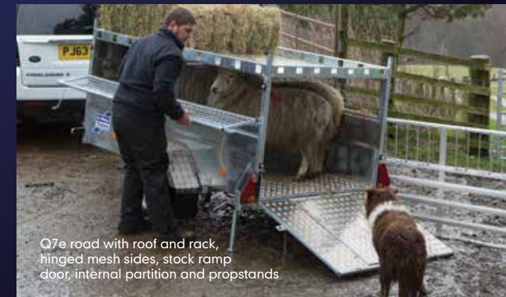
Q7e road with roof and rack, hinged mesh sides, stock ramp door, internal partition and propstands

* The roof and rack has a maximum recommended weight of 50kg and uses two fasteners which are easily removed.