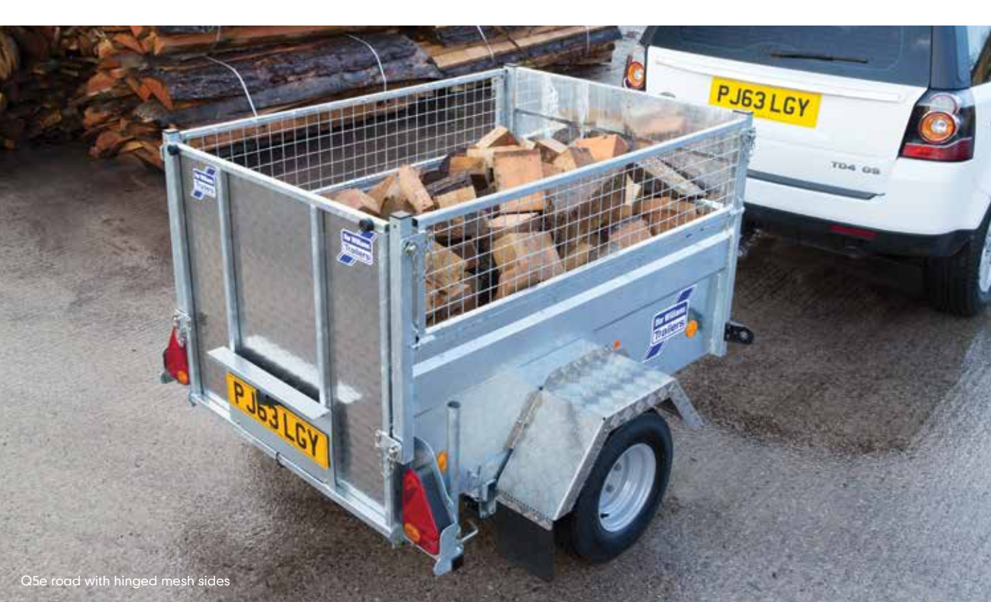
Q5e road with hinged mesh sides