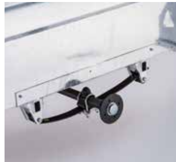
Leaf spring suspension is standard