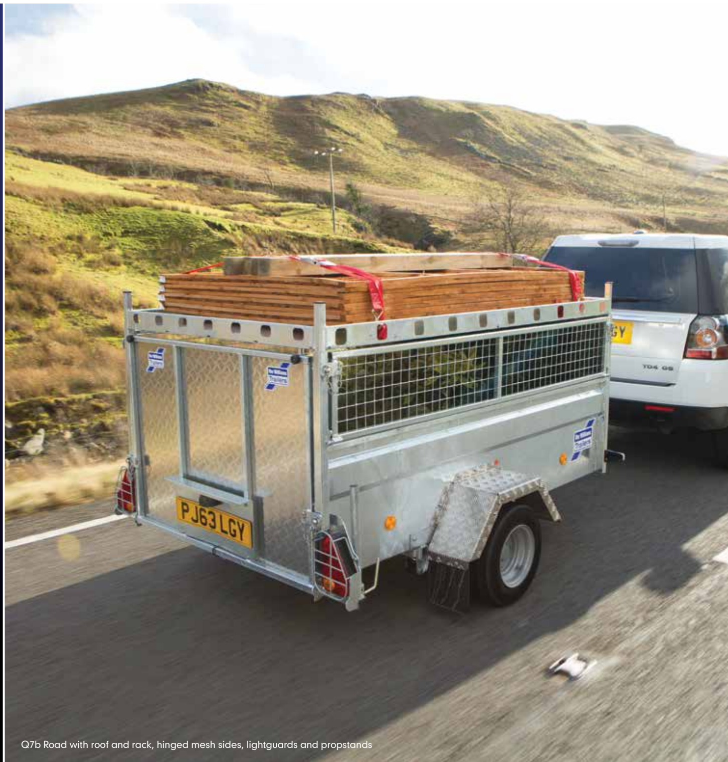
Q7b Road with roof and rack, hinged mesh sides, lightguards and propstands

We are an independent company with one focus: to build the best products on the market. More than 30,000 people choose our trailers each year – but we are not standing still. Our dedicated investment in new technologies and materials ensures that our products continue to exceed the expectations of our customers. We know that quality, strength, value and ease of maintenance are of vital importance to you. That is why we have made them the driving force behind everything we do.