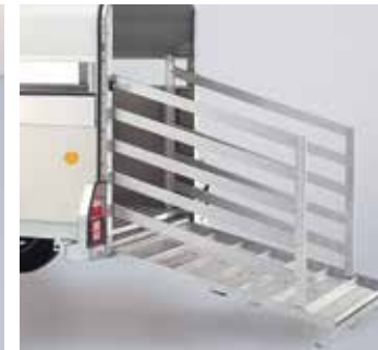
Optional ramp gates available on Q6, 7 and 8