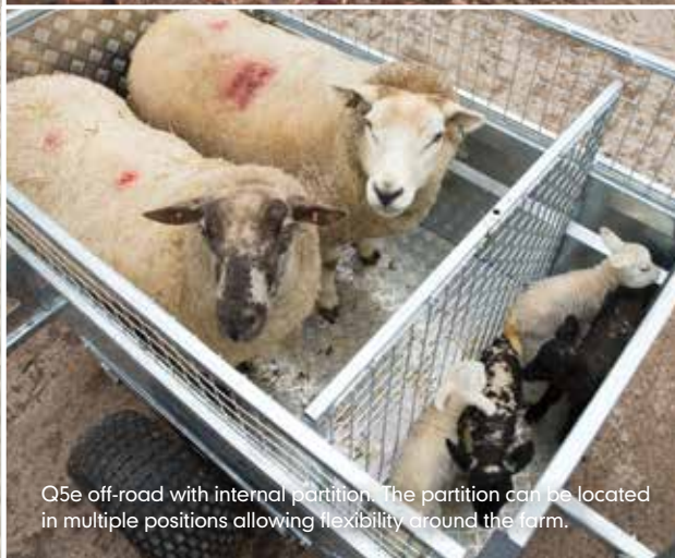
Q5e off-road with internal partition. The partition can be located in multiple positions allowing flexibility around the farm.