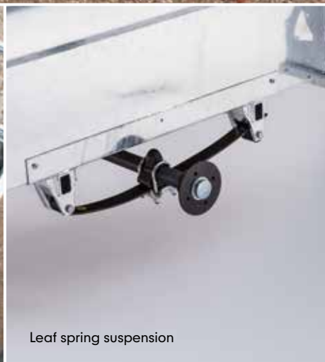
Leaf spring suspension