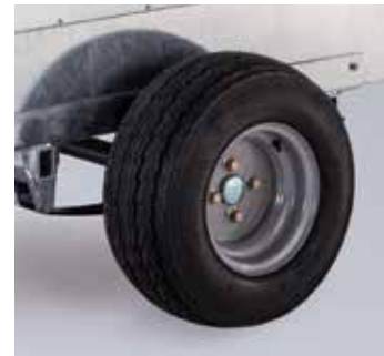
Q5/6/7e off-road flotation tyres (20.5 x 8-10)