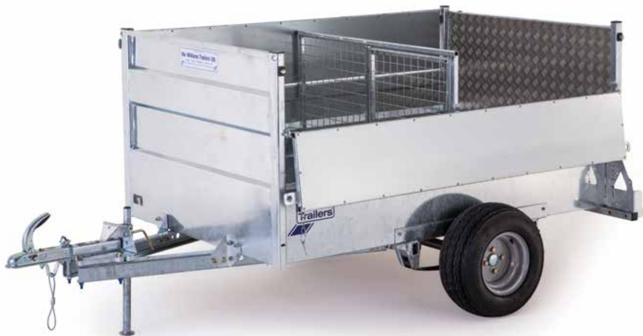
Q6 Q6e off road with flotation tyres showing different ramp, hinged sides and internal partition options